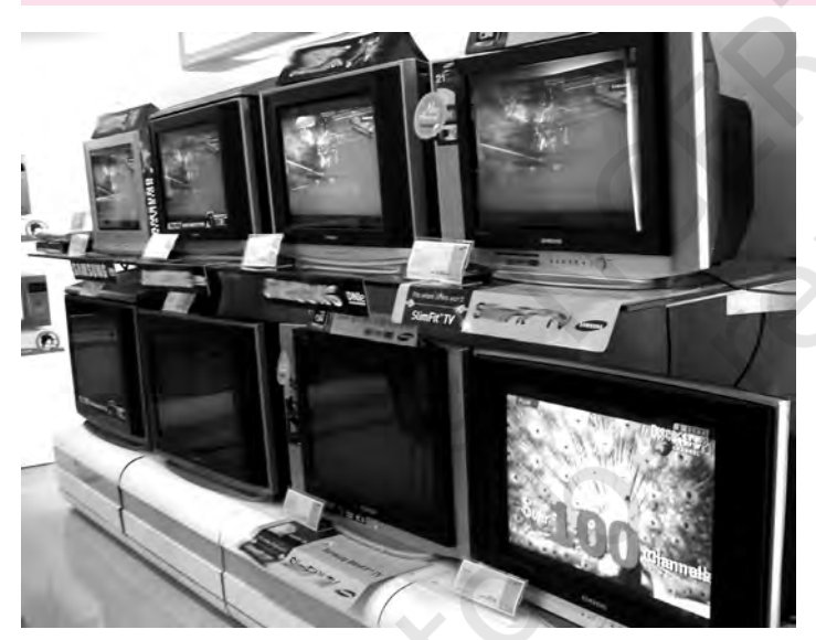
A television showroom