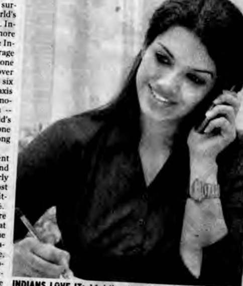
INDIANS LOVE IT: Mobile phones are popular but costlier services like Net phone are shunned. Women are champion text messagers.

We love short messaging services, indeed 100 per cent